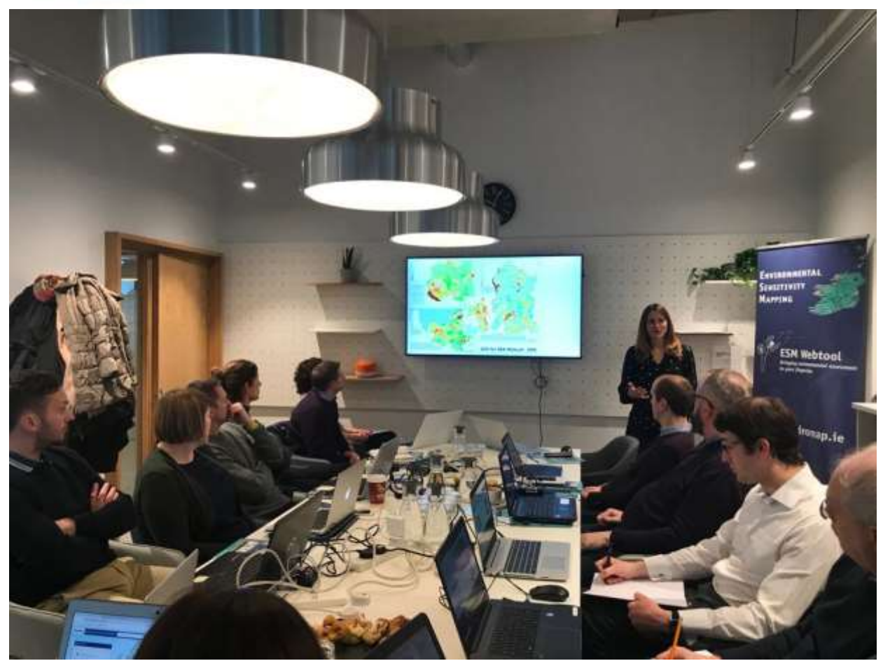
Training workshop for Regional Assembly and Local Authority planners on using the Environmental Sensitivity Mapping tool.