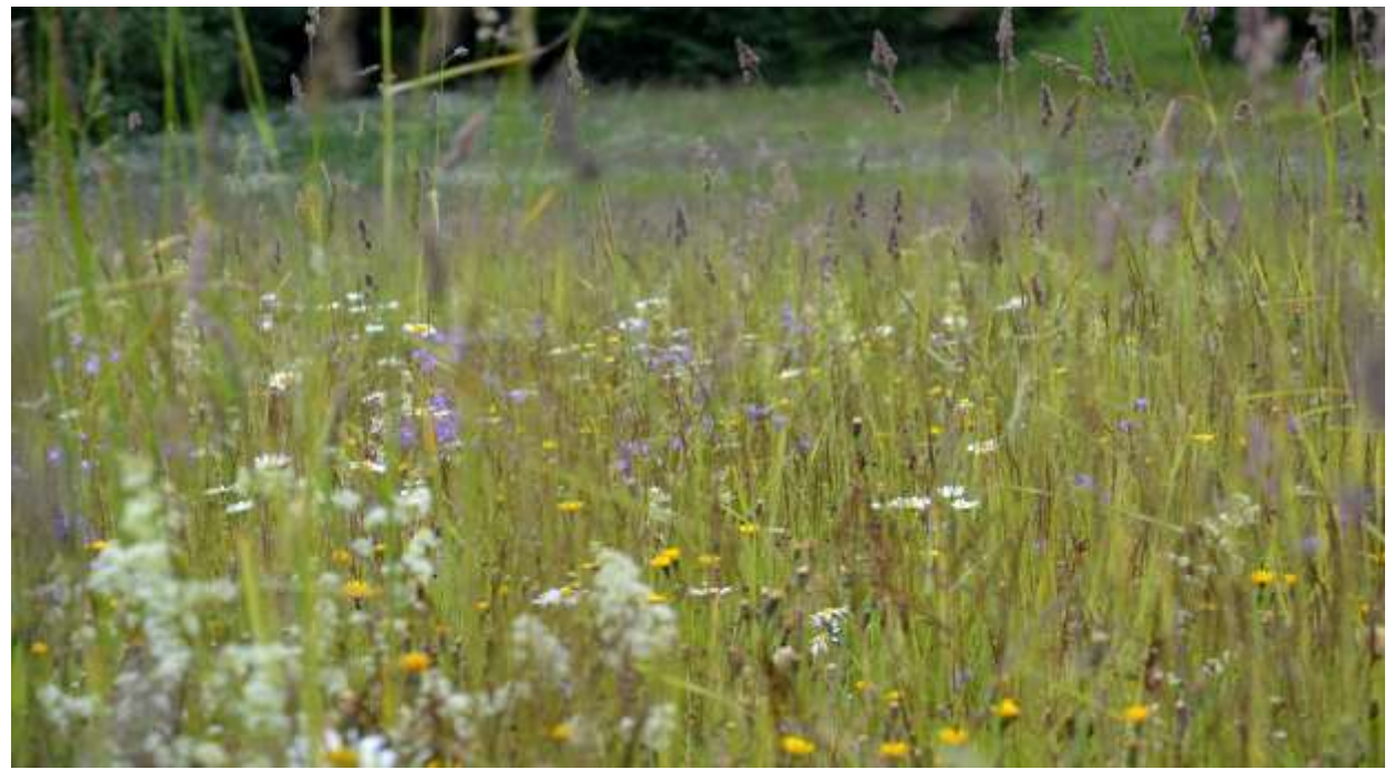
Latvian meadow in the summer.

The project "Integrated planning tool to ensure viability of grasslands" (acronym – LIFE Viva Grass) aims to prevent the loss of High Nature Value grasslands and increase the effectiveness of semi-natural grassland management by developing the Integrated Planning Tool (Tool). The Tool applies the ecosystem services approach to support decision making and land use planning by strengthening linkages between social, economic, environmental aspects in rural development policies and grassland management. This project also demonstrates opportunities for the multifunctional use of grasslands' ecosystem services as a basis for the sustainable development of rural areas.