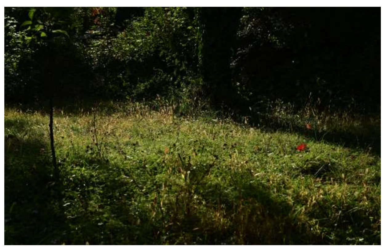
Third prize winner of a contest of nature-based gardens for private garden owners.

Source: <a href="https://zold.hegyvidek.hu/">https://zold.hegyvidek.hu/</a>