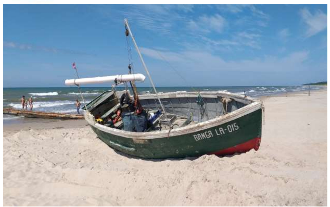
The Baltic Sea coast near Jūrmalciems.