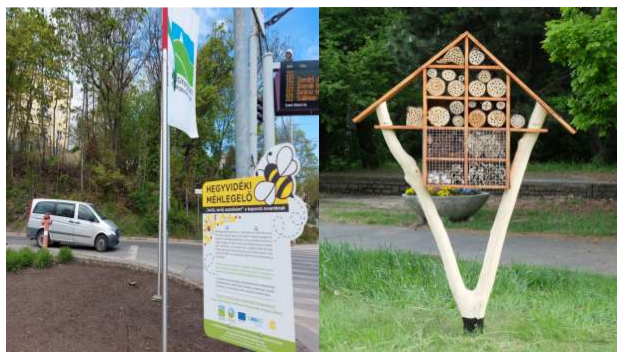
Bee pasture maintained by the Municipality of Hegyvidék.