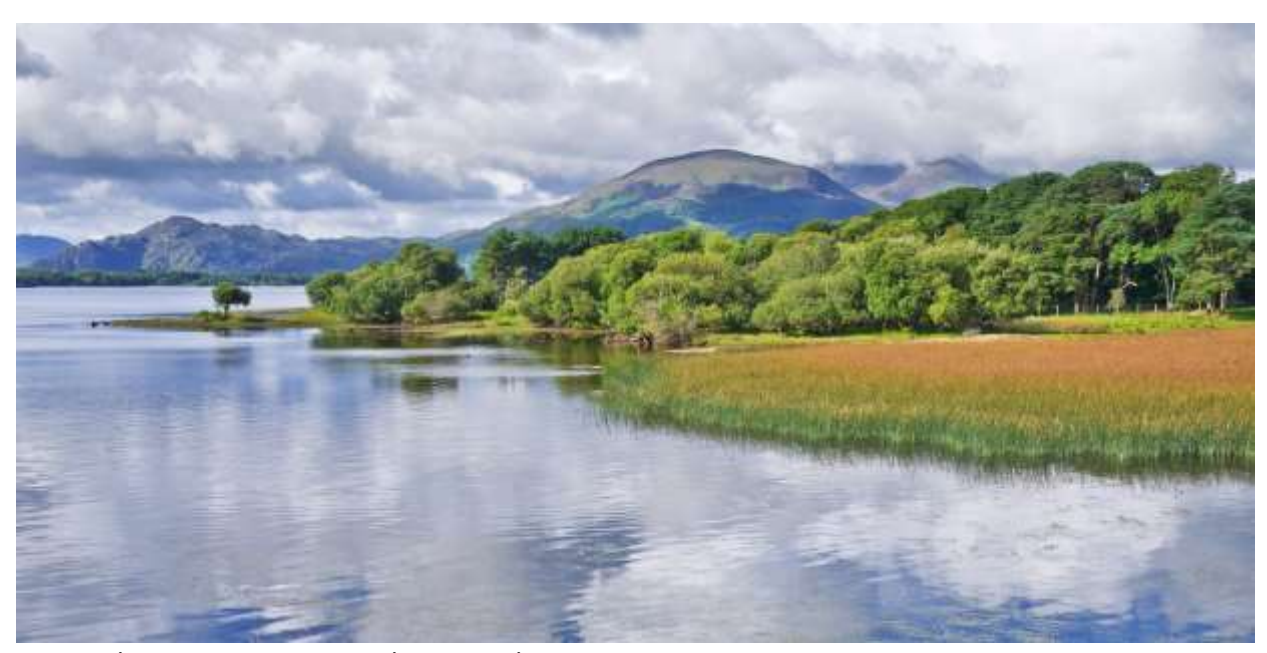
ESM Website Banner, Source: Shutterstock

The Environmental Sensitivity Mapping (ESM) Webtool is a novel decision-support tool for Strategic Environmental Assessment (SEA) and planning processes in Ireland. It is based on Geographic Information Systems (GIS) online technology and brings together more than 130 public datasets. More importantly, the ESM Webtool contains a geoprocessing widget that enables instant generation of plan-specific sensitivity maps, aiming to provide early warning of potential land-use conflicts to inform the scoping, alternatives, and impact assessment stages of SEA, and contributes to cumulative effects assessment. As well as supporting evidence-based SEA and plan-making, the tool is also useful for a wide range of other sectors and applications (e.g., environmental profiling).