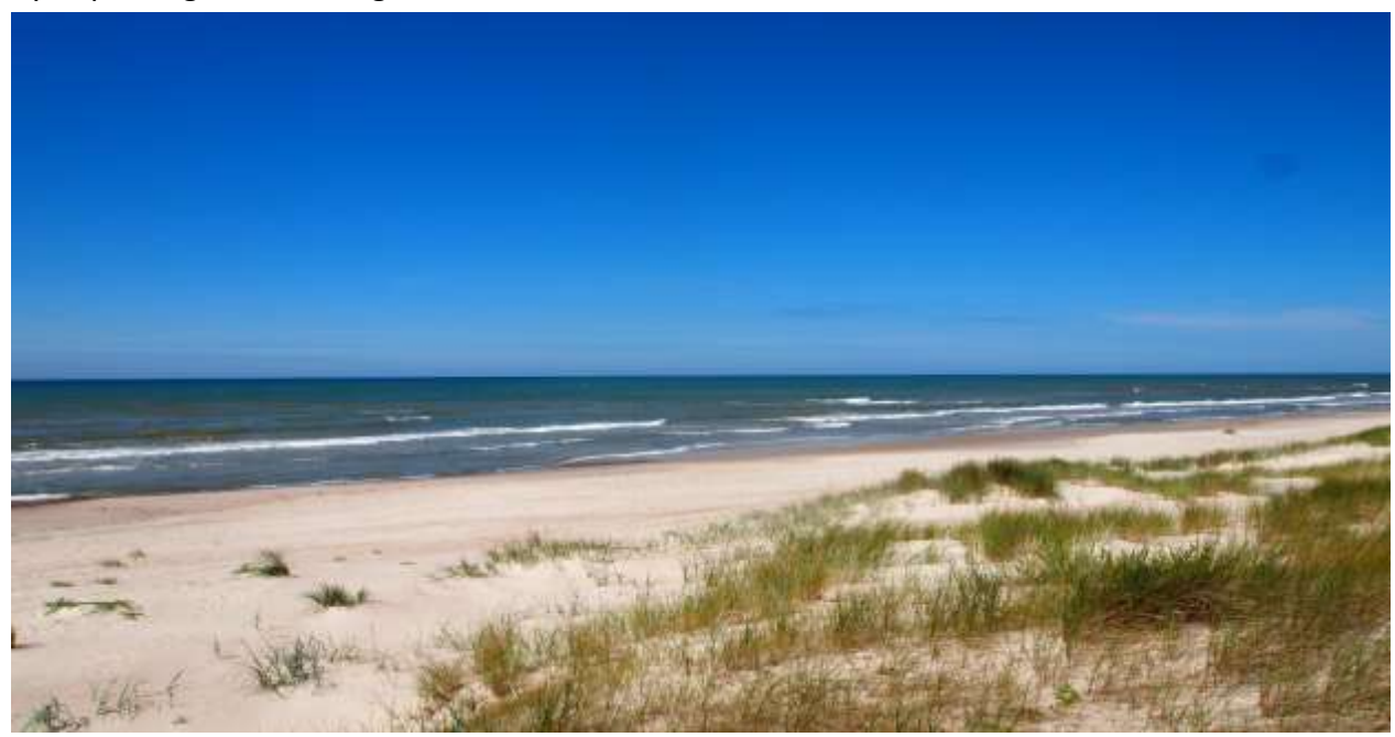
The Baltic Sea coast near Jūrmalciems, Latvia.

The project Land-Sea-Act aims to bring together stakeholders involved in the coastal management and planning to find solutions for the Maritime Spatial Planning and Blue Growth challenges around the Baltic Sea for elaborating the Multi-level Governance Agenda on the Blue Growth and Spatial Planning in the Baltic Sea Region. The project guides national, regional and local authorities, as well as stakeholders of various sectors aiming to 1) improve transnational cooperation and facilitate knowledge exchange to foster Blue Growth; 2) raise awareness, knowledge and skills to enhance the Blue Growth initiatives and integrated development in the coastal areas; 3) balance the development of new sea uses with the coastal community interests by improving the coastal governance.