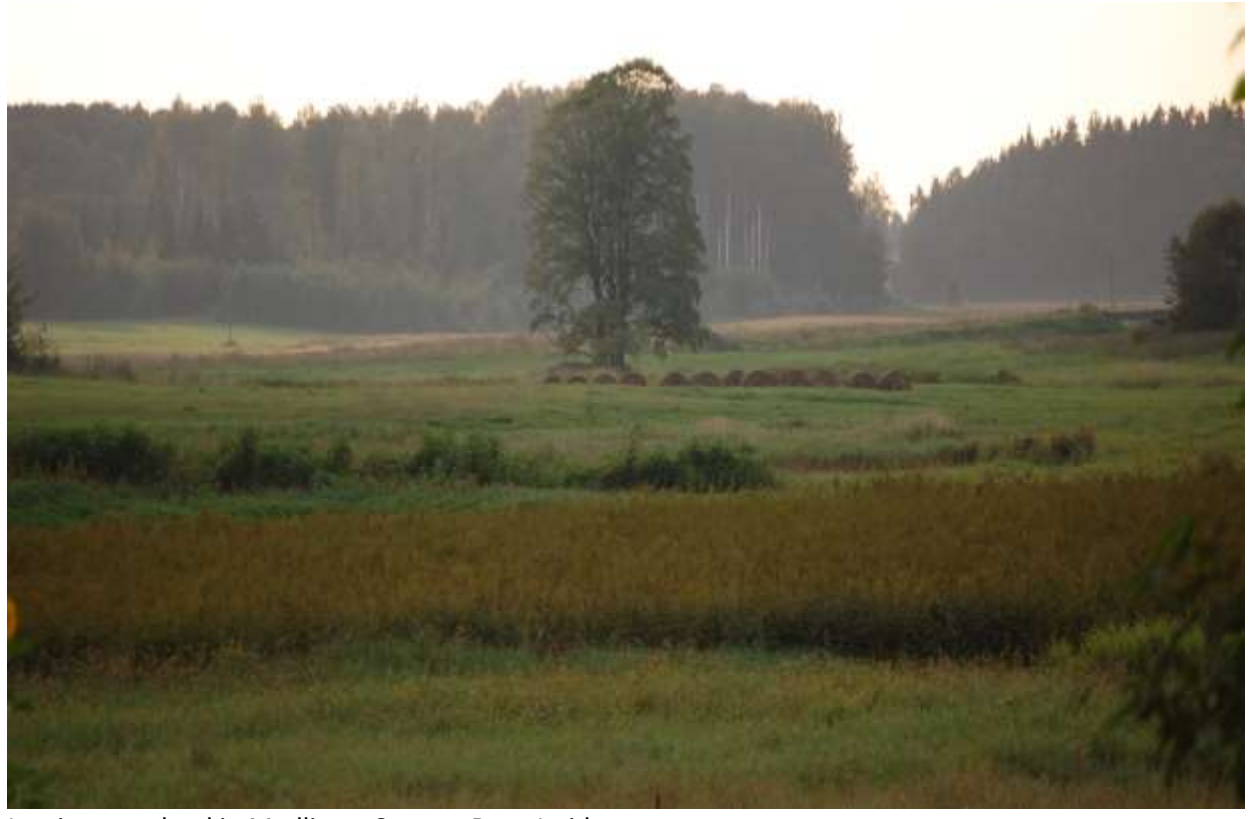
Latvian grassland in Madliena.