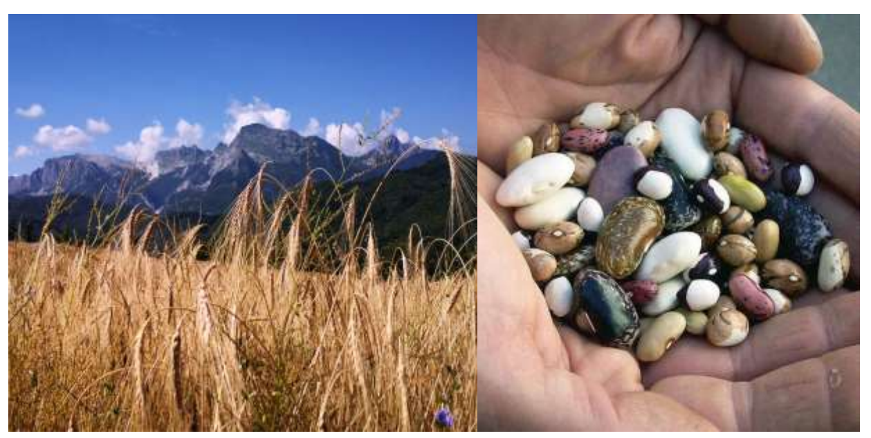
Garfagnana landscape of Toskana and an example of the agro-biodiversity heritage - variety of beans.

The Community for Food and Agro-biodiversity has been established in December 2017 in the mountainous area of Garfagnana, in the Province of Lucca, in the wake of the national Law no. 194/2015. This Law regulates the protection and valorisation of biodiversity of agriculture and food. The Food Community represents multi-actor, cross-sectoral and network governance arrangement. The Law is intended for the coordination of public and private initiatives already in place, as well as the promotion of new projects for conservation and valorisation of local agrobiodiversity. A relatively isolated localisation of the territory of Garfagnana, enclosed between two mountain ranges (Apuan Alps and Appennine), has given a rise to high biodiversity and a community strong sense of identity. On this basis, the Food Community has been established as the natural further step of a path that local actors – the Union of Municipalities and Custodian Farmers in the first place – have started several decades ago.